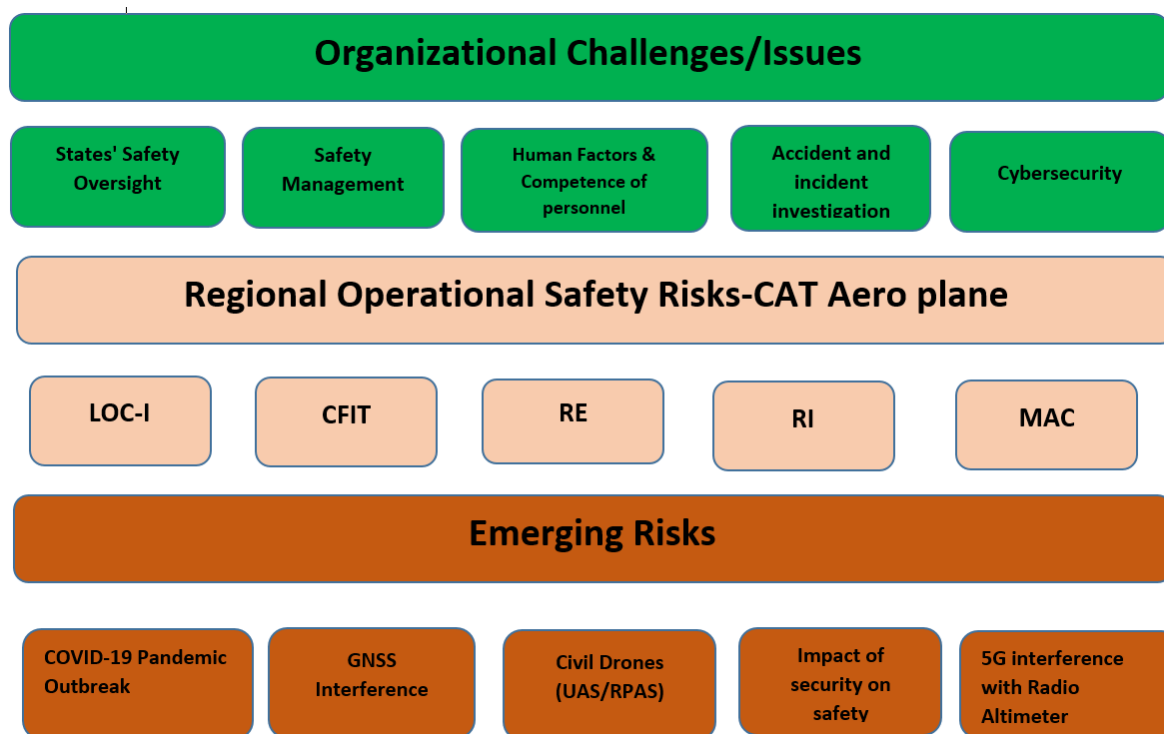
Graph 2: Safety Priorities

Therefore, the MID-RASP adopts three focus areas approach: